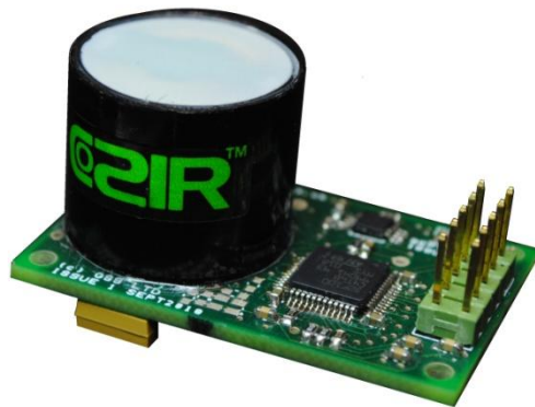
COZIR™ Wide Range Sensor