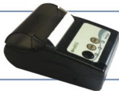
Mentor bluetooth printer (optional)

Up to 50 test results can be stored by vehicle registration or VIN. The USB connection together with the Automotive Refrigerant Configurator PC app can be used for software updates, sensor calibrations and simulating connection to a refrigerant recycling station.